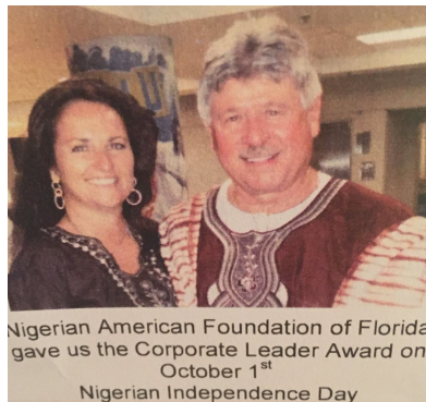
Nigerian American Foundation of Florida gave us the Corporate Leader Award on October 1 st Nigerian Independence Day

✓ The Nigerian History and Spelling Bee Competition taking place at Wolfson Center Lecture Hall, Miami Dade College North Campus, on Saturday, September 26, 2015 from 10am-2pm